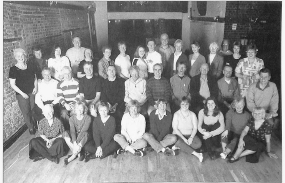
THE MIKADO CAST 2000